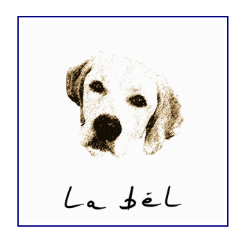
presents January 31<sup>th</sup>, 2014 [LBN024]